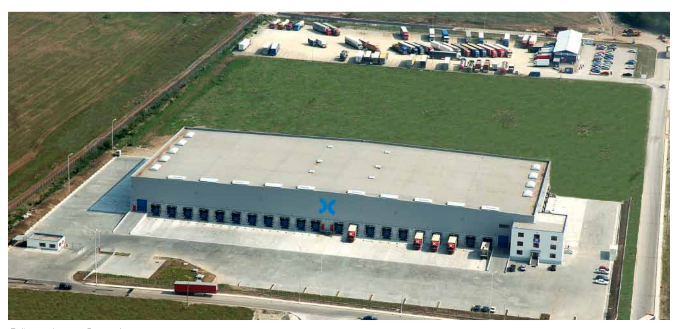
Full warehouse, Romania