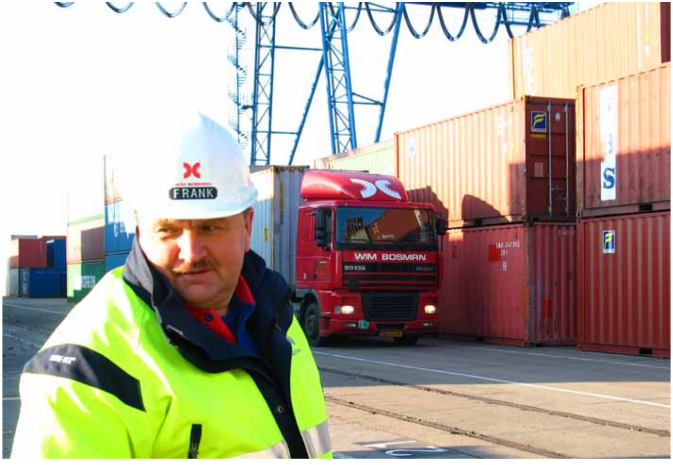
Emmerich Container Operations

WIBO means WIBO C.V.B.A. a co-operative company incorporated under the laws of Belgium.